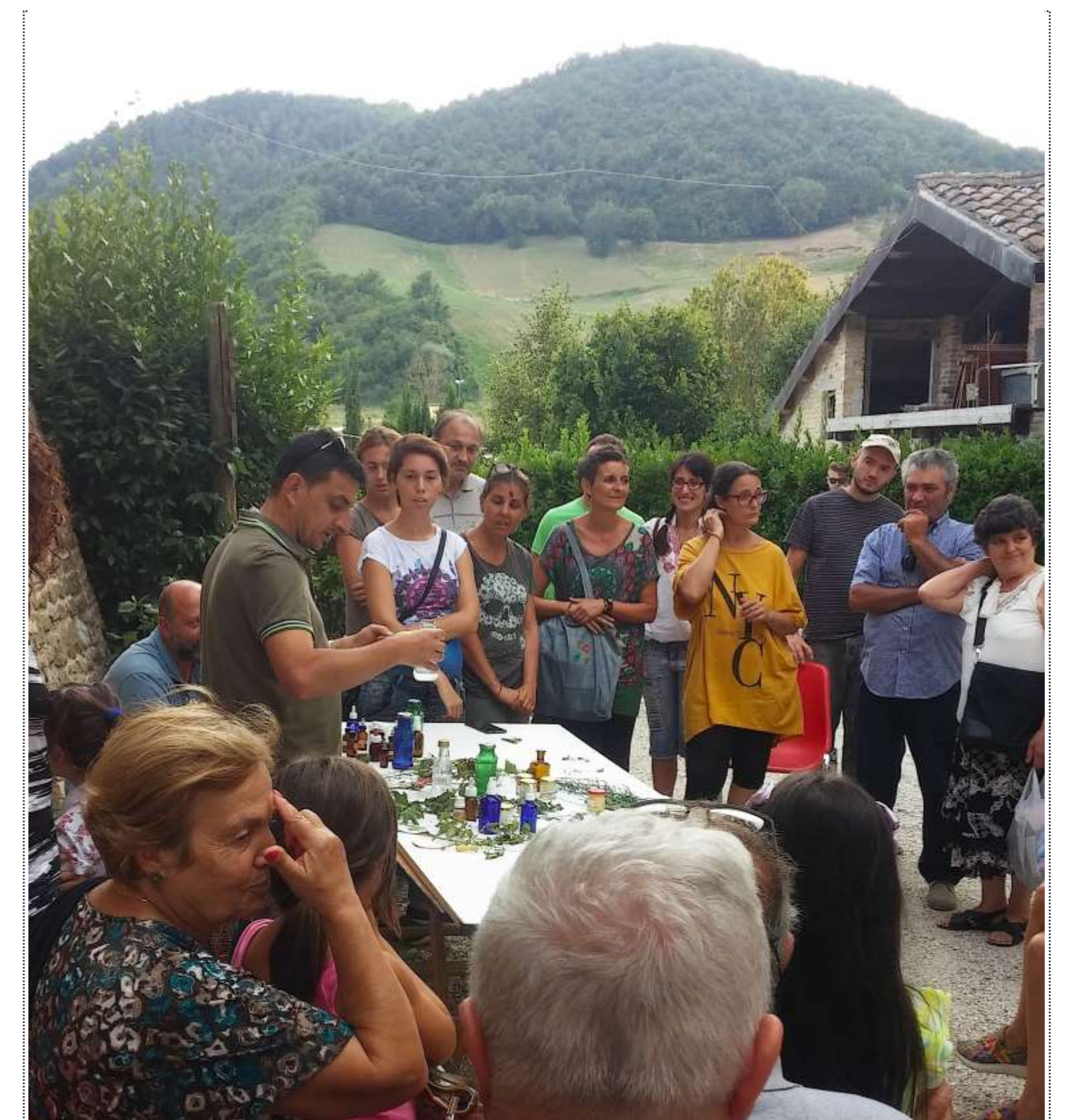
Demonstration and learning workshop

A key result of the Case Delle Erbe is that people can learn to avoid industrial farming and rely less on supermarkets, thereby reducing the chain of pesticides and herbicides, mass production, long-distance transport, refrigeration, packaging and marketing. Resource efficiency, connected to environmental awareness, empowers participants to become custodians of environmental equilibrium. Learning to respect plants and biodiversity, while improving people's health, offers a synergy of anthropocentric and biocentric benefits - a green message our society is in urgent need of.